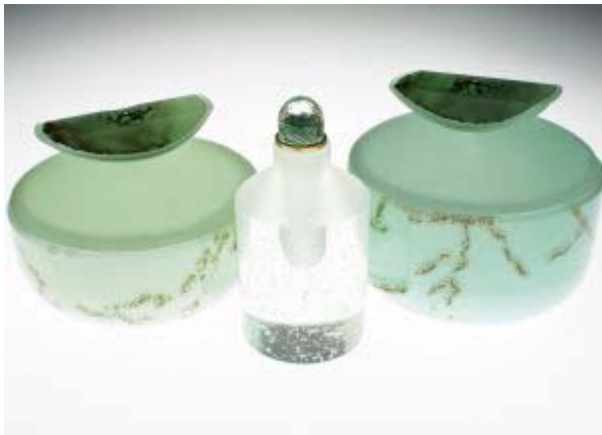
Sara Fell Precious Integrations series

Conference: “Living with Glass”: Exploring contemporary glass and interiors