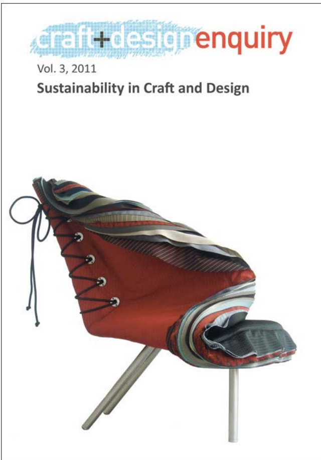
Simone Le Amon, Lepidoptera chair 2008, stainless steel, polyurethane, polyester, 110 x 85 x 70 cm Collection of the artist, Melbourne © Simone Le Amon