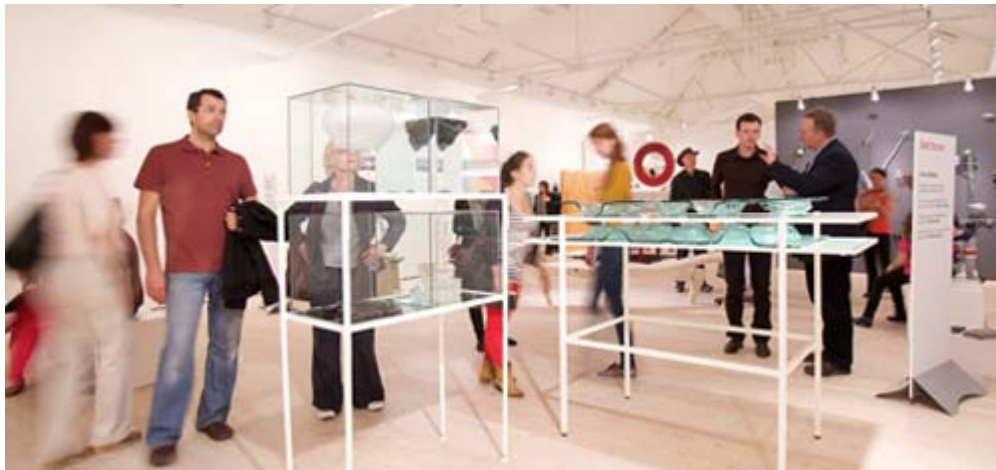
Project Space, Collect 2011.

The Crafts Council announced that COLLECT will return to the Saatchi Gallery, London, in 2012 - from 11 to 14 May. This prestigious fair will showcase the highest quality craft from around the world in the light and spacious surrounds of this stunning venue.