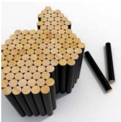
Multiple, side table, Raphaël Charles (Raphaël Charles Studio)