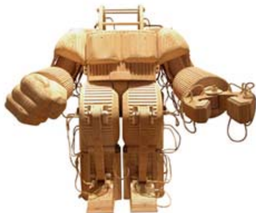
Michael Rea, Prosthetic suit for Stephen Hawking with Japanese Steel.

The V&A and Crafts Council celebrate the role of making in our lives by presenting an eclectic selection of over 100 exquisitely crafted objects, ranging from a life-size crochet bear to a ceramic eye patch, a fine metal flute to dry stone walling. Power of Making is a cabinet of curiosities showing works by both amateurs and leading makers from around the world to present a snapshot of making in our time.