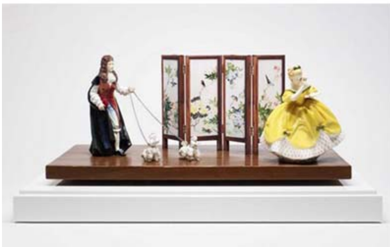
Barnaby Barford: 'Sorry...', 2009. porcelain, enamel paint, wood, card paper. H41 x W70 x D41 cm, ed.1/1