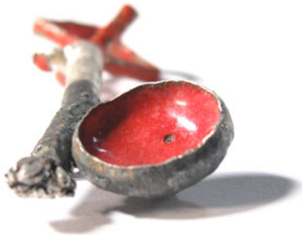
Eily O' Connell, “Carosel”, Silver, enamel, stainless steel at EUNIQUE 2010

Please, find general information and opening hours under topic 1.4 .