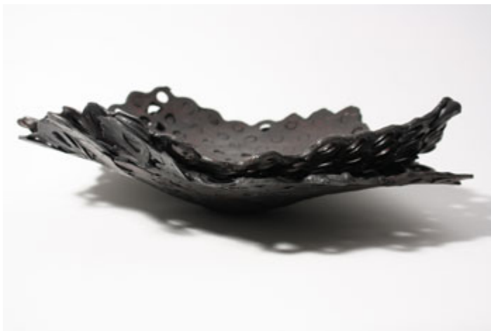
Hiawatha Seiffert, objectbowl at EUNIQUE 2010